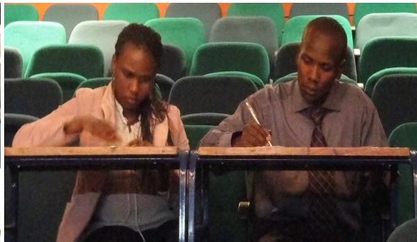
Participants shoot questions to the speakers