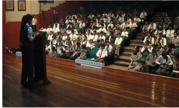
A section of the audience during the debate